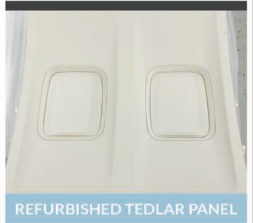
REFURBISHED TEDLAR PANEL