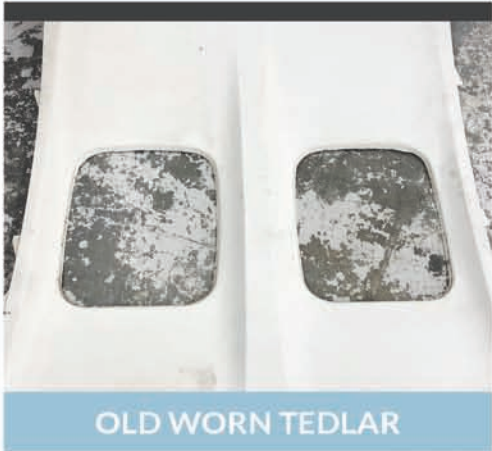
OLD WORN TEDLAR